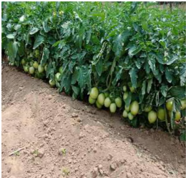
Hybrid Tomato Cultivation