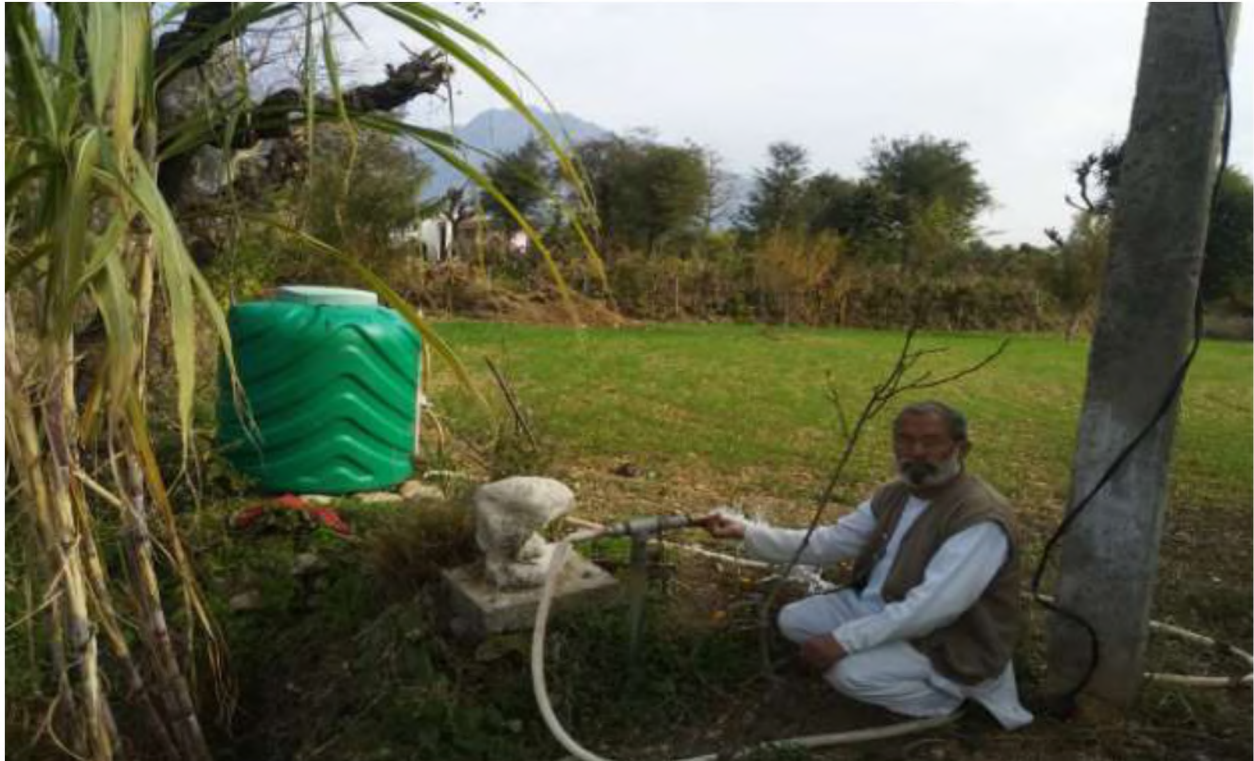
Lift Irrigation System

In order to save time & money the farmer has shifted to mechanization with support of Department of Agriculture. He has purchased power tiller on subsidy basis from department of Agriculture for ploughing purpose in parts of his farm where it is not possible to work with tractor especially under fruit plants.