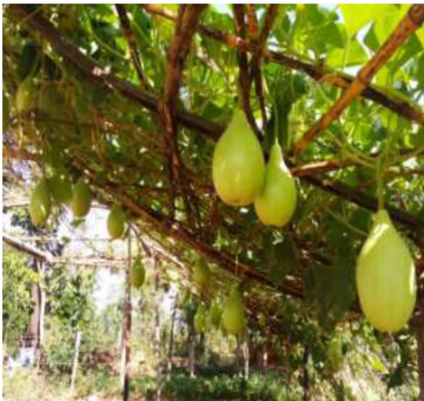
Bower System for Cucurbit Crops